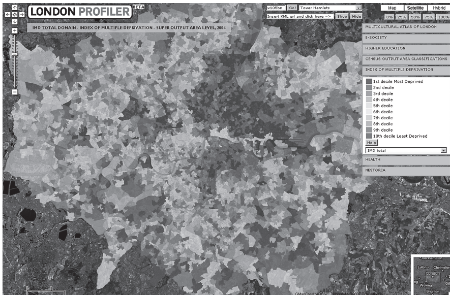
Fig. 12.5 London Profiler : full London view, Index of Multiple Deprivation tab, IMD total layer, 75 per cent transparency, satellite layer (See also Plate 27 in the Colour Plate Section)