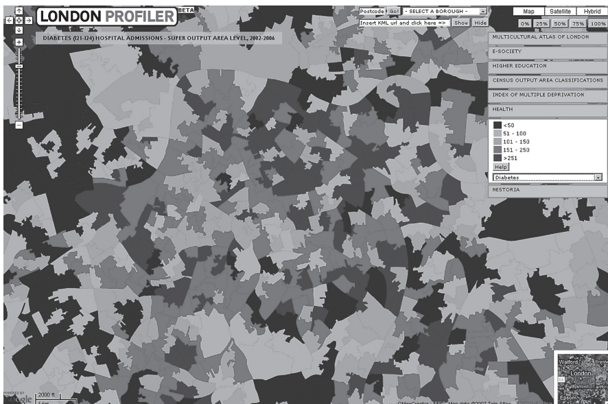
Fig. 12.3 London Profiler : health tab, HALT dataset, diabetes hospital admission ratio, 100 per cent transparency (See also Plate 25 in the Colour Plate Section)

Hospital admission data in the UK provide a very detailed picture of local health care needs and in this work we would like to illustrate how admission maps can be used to support public health campaigns. One of the first health themes in the London Profiler is diabetes risk presented as an admission ratio; i.e. the number of admissions for an area divided by the expected number were the age and sex specific rates to be the same as for the whole of London. An admission ratio of 100 is the London average; 50 is half and 200 the double. Profiling the diabetes admissions with a geodemographic system, for example the LOAC system, highlights neighbourhood types where admissions are more or less common (Fig. 12.3). Here