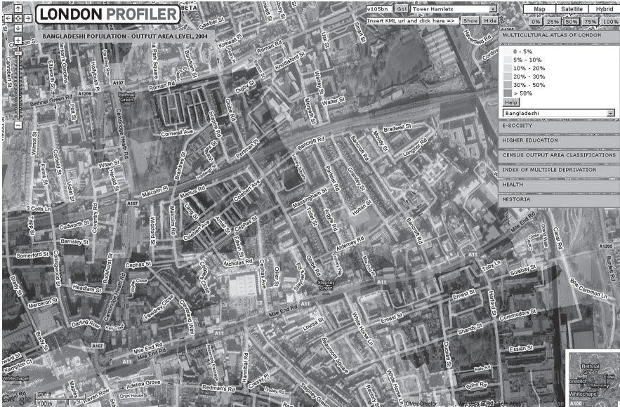
Fig. 12.7 London Profiler : postcode level, Multicultural Atlas of London tab, Bangladeshi population layer, 50 per cent transparency, hybrid layer