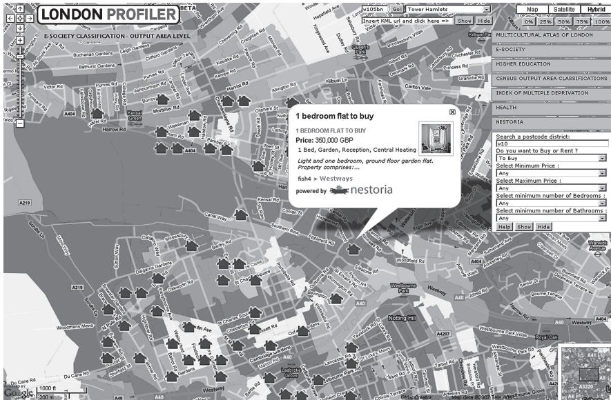
Fig. 12.6 London Profiler : postcode level, e-society classification tab and layer with a KML file overlay from Nestoria data, 100 per cent transparency, hybrid layer (See also Plate 28 in the Colour Plate Section)