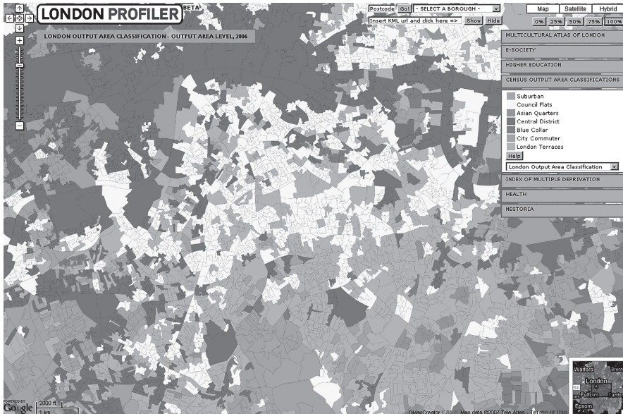
Fig. 12.4 London Profiler : London Output Area Classification layer, 100 per cent transparency (See also Plate 26 in the Colour Plate Section)

we see ‘Council Flats’ in particular, but also ‘Blue Collar’ and ‘London Terraces’ as having a higher risk than average (Fig. 12.4). Used in this way, geodemographics can be a reasonable way to perform exploratory data analysis of disease patterns and potentially geodemographics can also be useful providing the broader social context for diseases with a ‘lifestyle’ component.