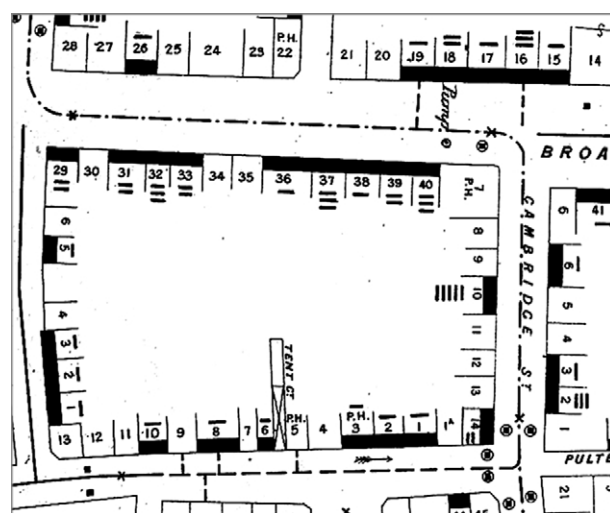
Figure 3: Edmund Cooper's map for the Metropolitan Commission of Sewers, September, 1854

In his report, Cooper added: "Since the outbreak, six men have been employed in these lines of sewers getting up information on this subject, all of whom, I am glad to state, are quite healthy, and entirely free from disease." 12 Thus, he suggested, sewer gases were unlikely to spread cholera.